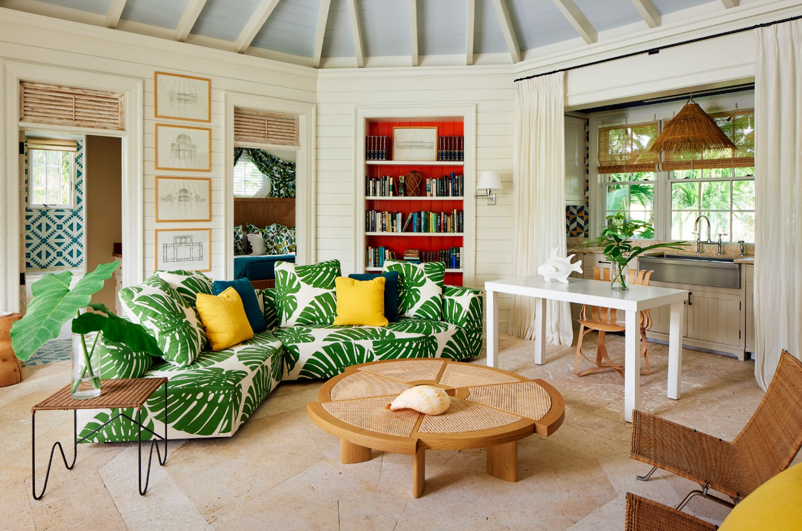
ABOVE THE GUEST COTTAGE LIVING ROOM INCLUDES A VIOSKI SOFA IN RAOUL TEXTILES FABRIC, A CHARLOTTE PERRIAND COCKTAIL TABLE BY CASSINA, A FRANK GEHRY DESK CHAIR FOR KNOLL, AND A SIDE TABLE BY HOLLYWOOD AT HOME.

OUR BIG BREAK OCCURRED when the lot next door became available. These clients, always supportive, understood the point we made that more land would actually mean less house. The expanded lot gave us room for a poolhouse, which doubles as a guesthouse as well as an escape for the homeowners, who rarely get a moment to themselves. Kiko and I designed the structure as an octagonal pavilion, inspired by the 1936 gem architect Maurice Fatio designed for artist Bernard Boutet de Monvel in Palm Beach. Now, with two buildings and a master plan, we had an opportunity for a real garden, and the immensely talented Fernando Wong and his partner, Tim Johnson, came aboard to give the property just that. Fernando brought huge value to the project by creating outdoor rooms along the road, and by opening the view of the golf course to make it seem like it belongs to this house. Around the pool, his approach was subtle. “We created a very subdued color palette consisting of different shades of green in order to keep the pool as the focal point,” Fernando says. “The one strategic pop of color comes from the purple bougainvillea framing that idyllic porch—the place the family eats, plays ping-pong, and organizes flashlight tag on the golf course after dinner. The color tells you you’re going to have fun there.”